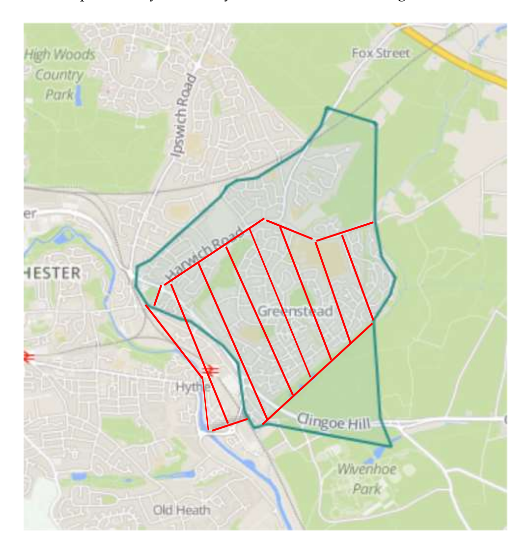
Figure two: Map of the St Andrew's Ward, Colchester bordered in green. The red hatched area is that part of St Andrew's and Harbour wards where the crime rate was differentiated from data collected at ward level. It is also an area where large numbers of students live.

This form of spatial analysis requires an interdisciplinary set of skills on the part of the students. They need the space-time analytical skills of a geographer and the personality trait analytical skills of the sociologist.