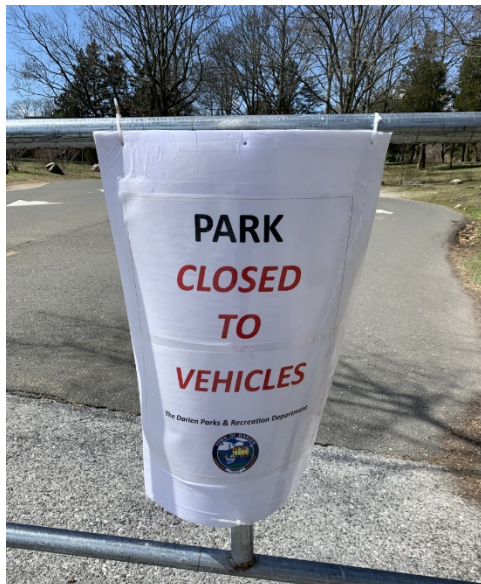
Figure 1 'Park Closed to Vehicles' sign