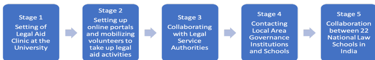
Figure 2: Stages of implementation of the model