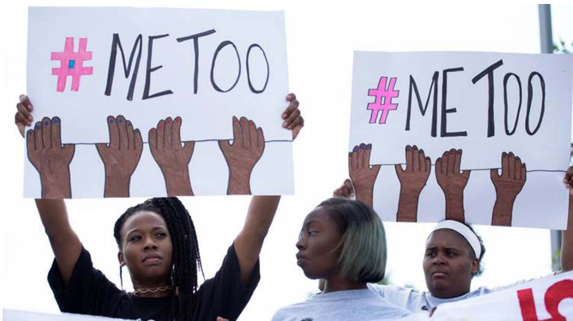
Figure 3 Young people holding protest signs which read #MeToo

what types of speech should be protected by the constitution. We chose images of people of color exercising their rights to free speech to reflect the community where the law students teach. We want the high school students to easily visualize themselves speaking out against injustice and engaging in their community.