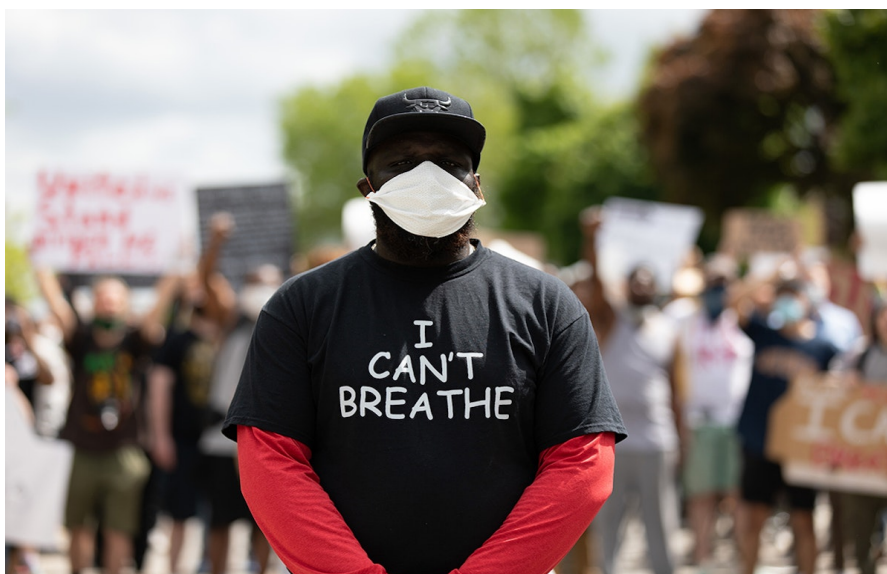
Figure 4 Image of a protester with a t-shirt that reads 'I CAN'T BREATHE'