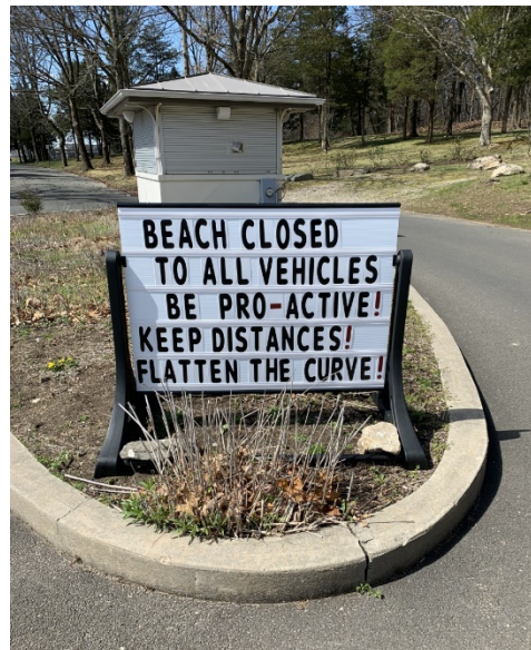
Figure 2 'Beach Closed to All Vehicles' sign

Polls can also be a useful addition to a lesson. There are many poll programs available that have a large variety of options. We use the basic poll feature contained within Zoom, so our high school students do not have to access another platform. Student participation in the polls used in our classes was almost one hundred percent. Students who refused to contribute to discussions would participate in a poll. Clicking on a poll response is a very small demand of a student. However, using a poll can have a disproportionately positive effect on class participation. The students unwittingly become invested in the topic. They vote in the poll and therefore commit to an answer. We noticed they are more willing to contribute verbally after they participate in a poll. Our First Amendment and Protest lesson starts with a series of images and a simultaneous poll, which asks students whether the image depicts “speech”. The students were very engaged during this lesson and carefully analyzed