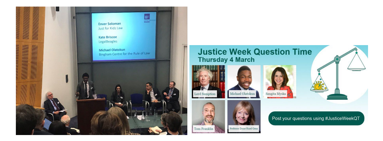
LSB Justice Week Events

The most authoritative and influential obligation to deliver PLE is the framework surrounding the Education Act 2002. S78 of the Act states that maintained schools should provide a 'balanced and broadly based curriculum' which 'promotes the spiritual, moral, cultural, mental and physical development of pupils at the school and of society'. This obligation would go on to be known as 'SMSC' by the teaching profession. The Department for Education modified this requirement in September 2014 to require SMSC to include promotion of the 'Fundamental British Values'. These 'FBVs' comprise: